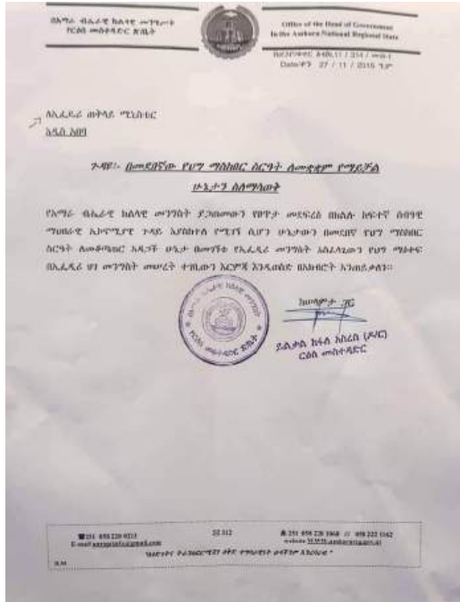
Figure 7: Roughly translated, this is an official request sent by the governor of the Amhara region to his party leader, the prime minister, asking for an out and blatant war to be waged against the Amhara region he is supposed to lead.

In a deadly bid to do away with the Amharas, whom the government in power considered to be one stygian, incorrigible, and indomitable force that can stand in its divisive way, the government in power ramped up its effort to get it over with the Amharas for once and for all. To this end, the government waged a full-fledged war on the Amharas in July 2023.