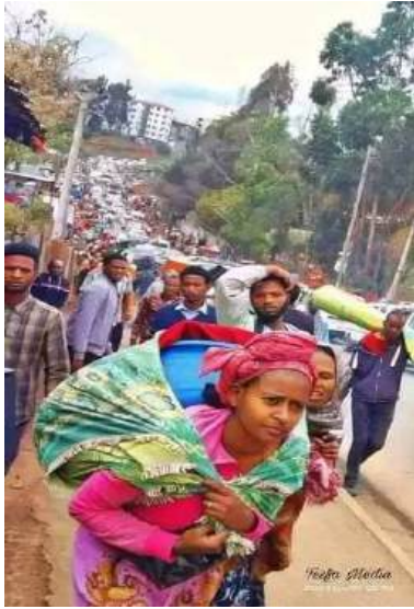
Figure 2: Hundreds of thousands of Amharas being evicted from Addis Ababa during 2022/23.

What is more, the Amharas were subjected to unlawful killings in almost all provinces of Ethiopia. Such is the scale and berth of atrocity being visited upon the Amharas, that in Benishangul Gumuz regional state alone the Amharas were buried in a ditch dug by excavator. As could be seen below, in a country where it is customary that the dead is given the utmost respect and obsequies are more honorable than the respect given to kings, the dead bodies of the Amharas were piled to a mound from which a loader scoops them to the capacity of its blade and drops them later into the ditch excavated by a machine. This fascistic way, both Christian and Muslim Amharas were buried in a single ditch.