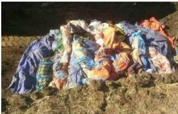
Figure 3: A pile of the massacred Amharas in the Benishangul region, western Ethiopia, in December 2022.

What is more, the Amharas were subjected to unlawful killings in almost all provinces of Ethiopia. Such is the scale and berth of atrocity being visited upon the Amharas, that in Benishangul Gumuz regional state alone the Amharas were buried in a ditch dug by excavator. As could be seen below, in a country where it is customary that the dead is given the utmost respect and obsequies are more honorable than the respect given to kings, the dead bodies of the Amharas were piled to a mound from which a loader scoops them to the capacity of its blade and drops them later into the ditch excavated by a machine. This fascistic way, both Christian and Muslim Amharas were buried in a single ditch.