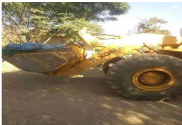
Figure 4: The dead bodies of the massacred Amharas loaded into the blade of a loader.