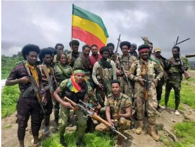
Figure 8: Despite all other ethnic organizations in Ethiopia, such as TPLF and OLF that create their own new flags, the Fannos are noted for their unwavering love, respect, and honor for the Ethiopian flag. This flag – the green, yellow, and red – has become a definition of the icon of freedom also among brother Africans and other oppressed peoples worldwide.

context of Ethiopian politics the name and organizational identity popularly known as FANNO.