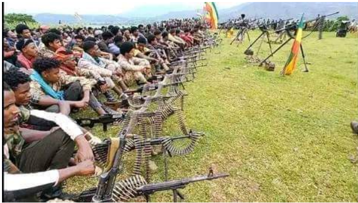
Figure 9: Fannos displaying a remarkable array of weapons they captured following an outstanding showdown and feat of bravery in their existential fight against government forces.