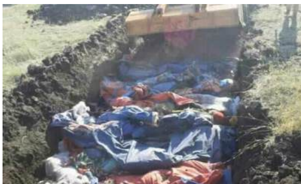
Figure 5: The dead bodies of massacred Amharas being unloaded into the ditch dug by a bulldozer.