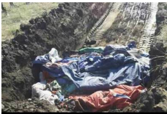
Figure 6: The tire marks of the loader clearly suggest that it had brought and offloaded the dead bodies here before returning to the pile (Fig. 3) of massacred Amharas to fetch another round of dead bodies for this bulldozer-dug ditch.